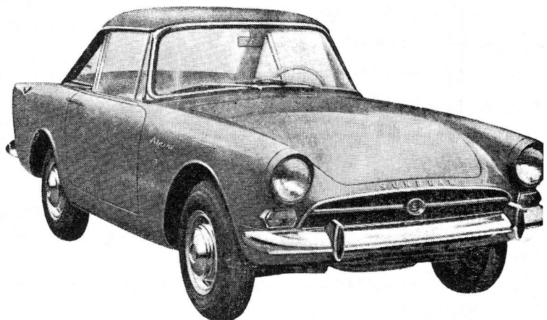
SERIES IV "G.T."