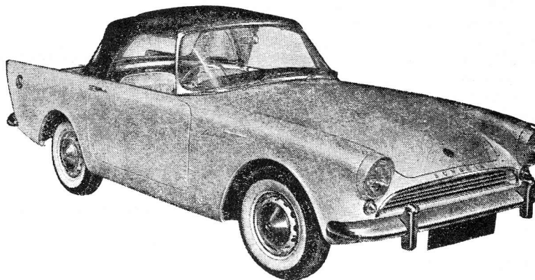
SERIES I and II

All Sales are made subject to the Company's "Conditions of Sale" current at the time of delivery.